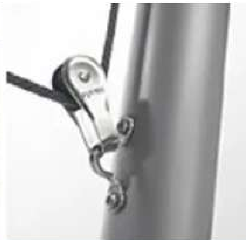
Cable pull parasol