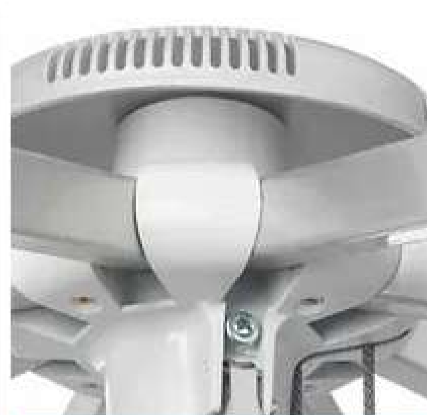
Upper star section C...