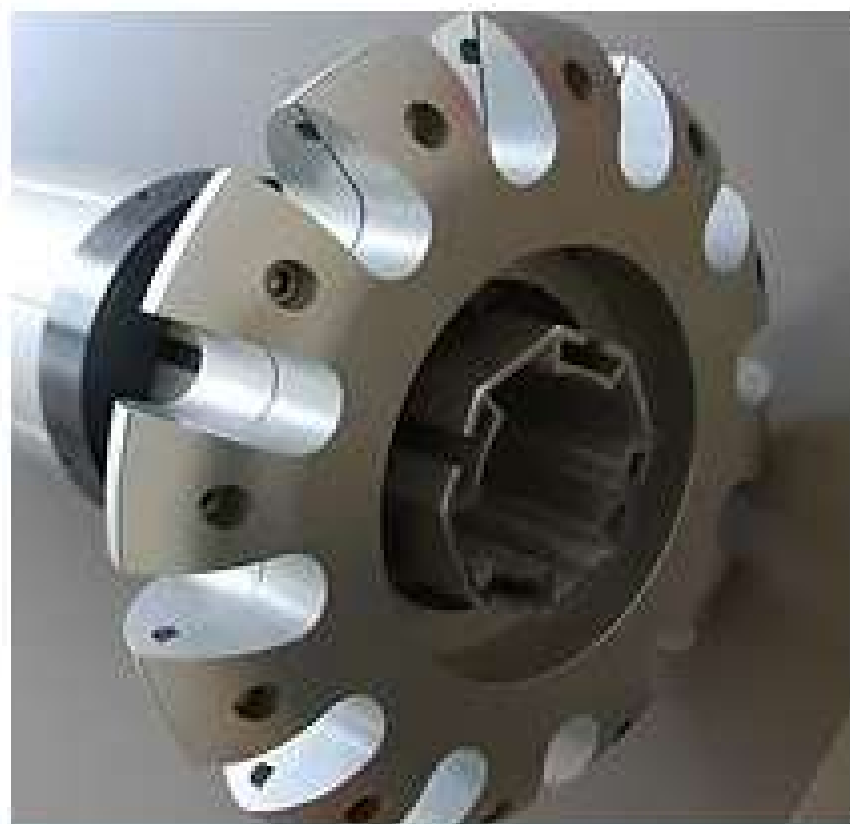
Star part aluminum ...