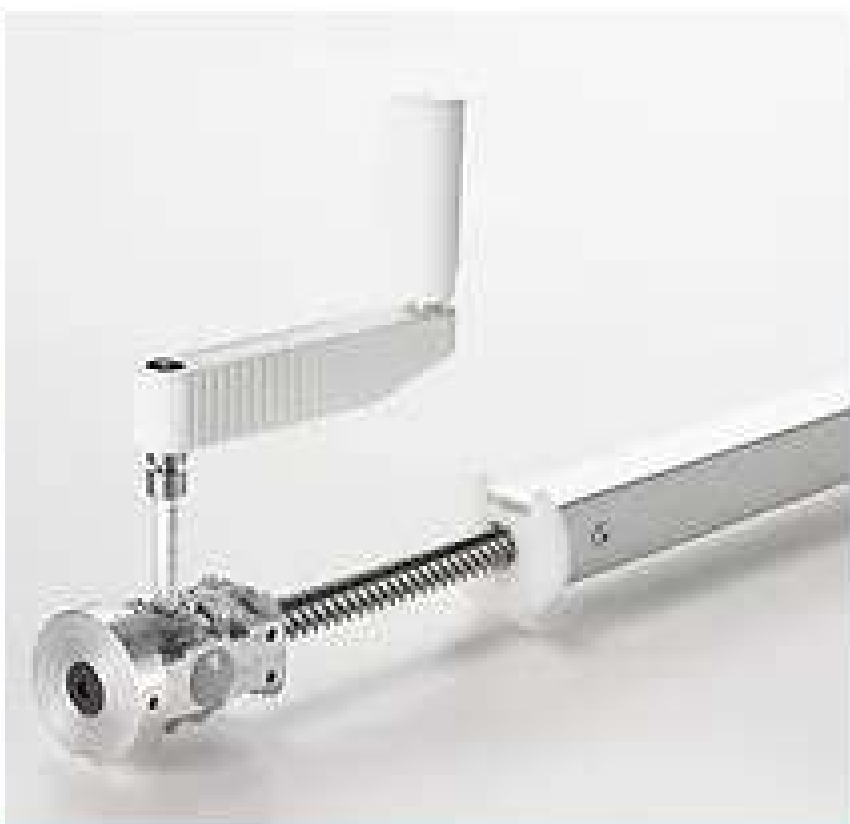
Crank umbrella drive